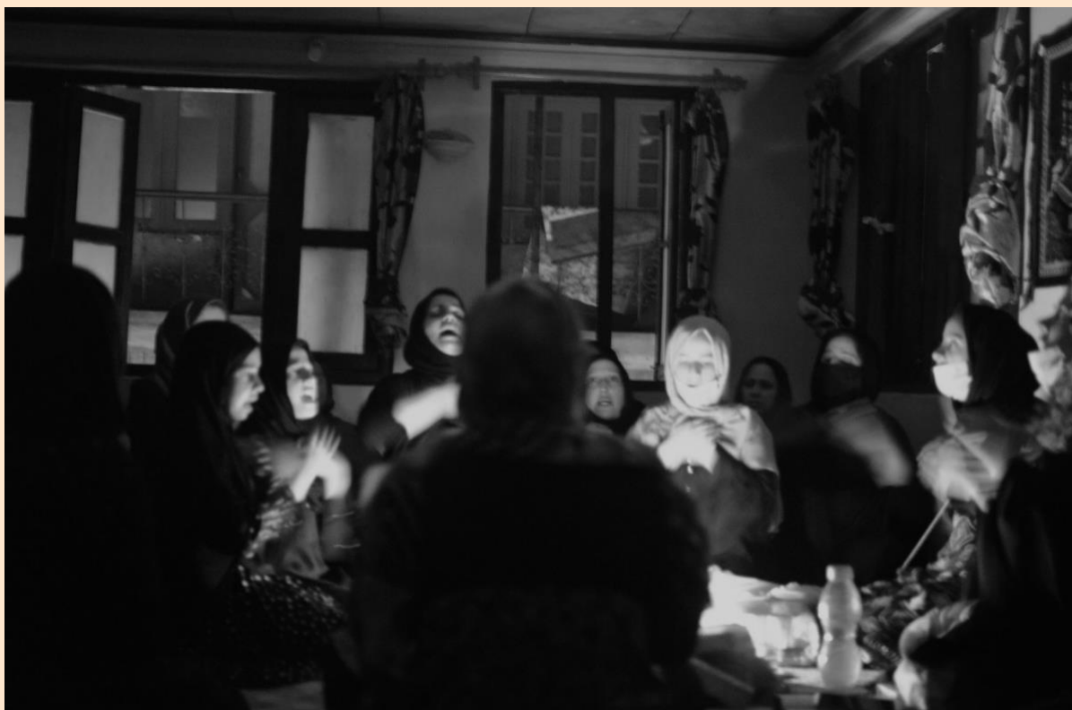
Figure 1. Shia women mourning in a Muharram majlis . Photograph taken by the author, 2020.

On August 29, 2020, the tenth day of Muharram (the first month of the Islamic calendar), religious processions of Shia mourners in Kashmir were subjected to disproportionate violence by the Indian state forces. The mourners, including Shia women, were injured. Many people were arbitrarily detained and criminalized for violating a ban on religious processions, and for exhibiting sentiments of self-determination. Many Shia mourners received pellet injuries and for pelting stones at the armed forces (Ganai, 2020). The procession taken out on the Day of Ashura (10th day of Muharram) has been banned by the state since the early nineties, in the fear of Shia mourners' political affirmations to the movement of self-determination. This was not the first incident of this kind: the use of force and violence on public gatherings in Kashmir has been ongoing for decades. i However, this incident, an otherwise routine practice of state violence in the world's most militarized region, ii sparked conversations about the Shia religious identity and its interconnection with Kashmiri political identity, which has long been seen as distinct. iii Shia men and women were seen responding to this violence by invoking religious slogans and seeking strength from their faith. The religious practice was, both, a cause for their marginalization, and the means of resisting it.