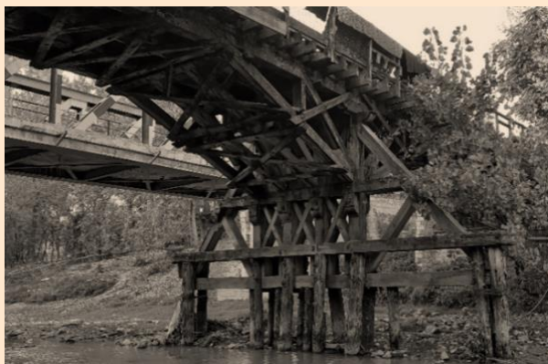
Figure 2. Remains of the old Yaroo Bridge/2020