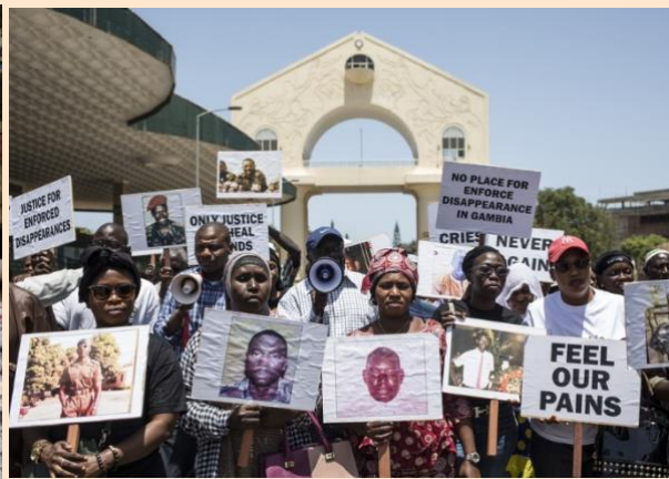
Figure 2. Families of the victim protest in Gambia.