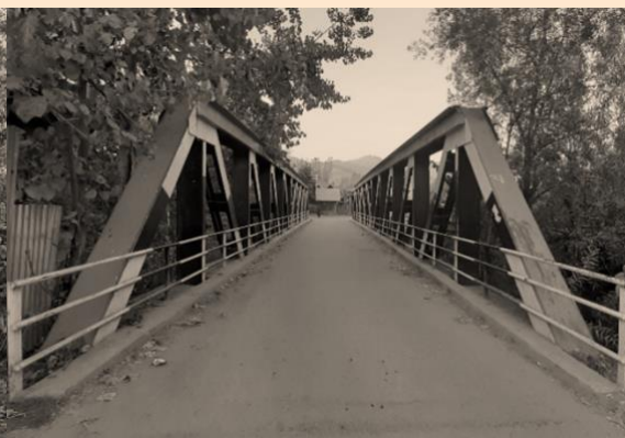
Figure 3. Newly reconstructed Yaroo bridge/2020

Hadishah Kadal (Figure.1) in Sopore on the river Jhelum was burnt down completely during the Tehreek 3 and was reconstructed a few years later according to the testimonies of locals. When I enquired about who burnt it, I sensed an eerie reluctance in the responses, “we can’t say that... they came and lit it on fire during the night... at 1 am... so we can’t say who burnt it. Maybe it was the military, maybe someone else”, said one of the interviewees. The destruction of bridges constituted violence against the architecture as well as those who used it on an everyday basis. The bridges became a physical apparatus of separation overnight. The two localities, Hadishah and Khanqah, connected by the bridge were disconnected after the bridge was set on fire around midnight. The original bridge of Yaroo (Figure.2) was constructed in 1977 on Nalle Maver . It was partially burnt in 1993. The reconstruction of Yaroo bridge took over a decade, finally opening for public use in 2016 (Figure.3).