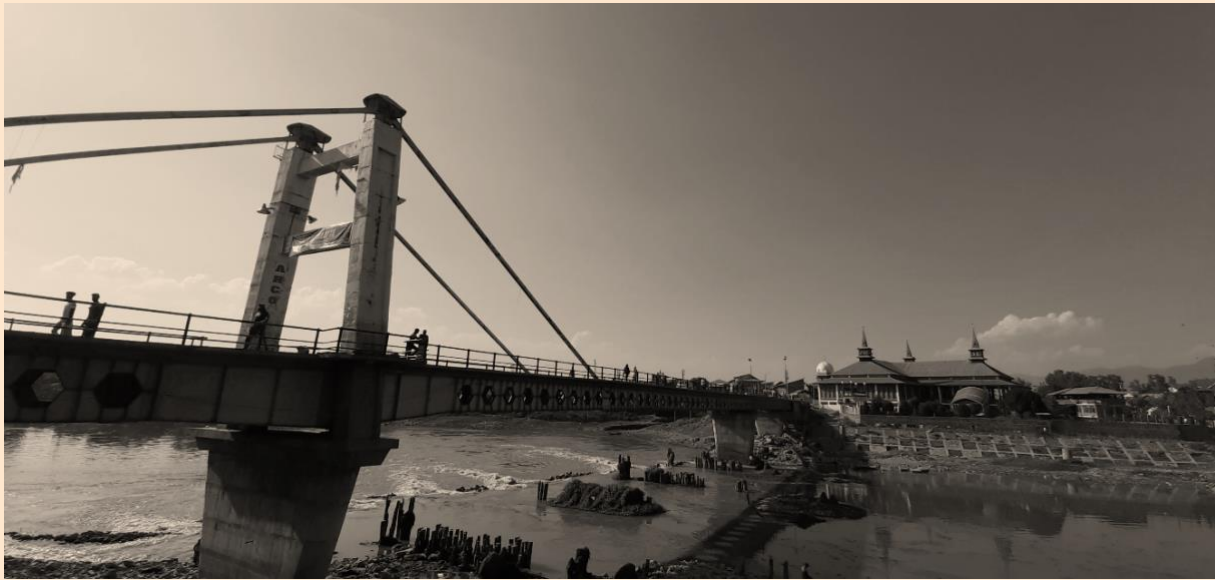
Figure 1. Hadishah Kadal, Sopore/2020

Bridges are repositories of embodied trauma and loss in Kashmir. This article assesses the strange phenomenon of bridge-burning during the 1990s. Kadal 1 is presented as a personified object- a stationary witness to people's immobility, hardships and resistance. Tracing the history of two bridges in North Kashmir's Sopore-Kupwara stretch, the essay revisits the incidents through oral testimonies of locals in the North Kashmiri villages of Yaroo-Khouhn. The bridge which connects these two villages was reopened in 2016 after being razed in 1993