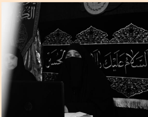
Figure 5. Woman delivering a sermon about the struggles of Bibi Zainab.

In framing the tragedy of Karbala, with women's narrative at the center, one can observe that they played an active role in the event, made important decisions, and were the carriers of this narrative to the world. Zainab took charge of narrating the events of Karbala; what she did and how she upheld Islam, forms an important part of elegies and narrations for Shia believers.