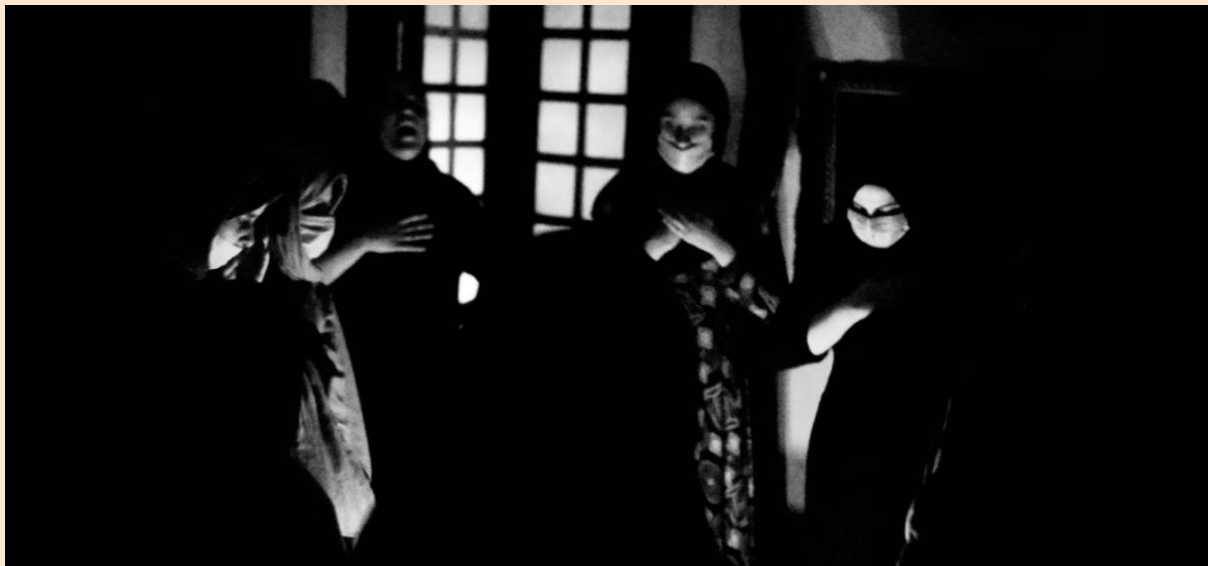
Figure 1. Women performing the ritual of chest-beating.

For Shia women, there is an emphasis on religious education in maktab/darsgah (religious school), to read Quran, to become familiarised with the tenets of Islam, the lives of the Prophet, and his family members, to learn distinct codes of conduct of piety and modesty. Besides the religious knowledge, Shia believers learn the vocabulary of loss, early on, as they learn about the struggles of the Prophet and his family. So much so that they call themselves azadaar (mourners). There is an emphasis on shahadat (martyrdom) of the Imams, of taqlid (learning through imitation), mazloom (victim), maqal (place of death), zulm (oppression), and zorwar (oppressor). This vocabulary is enhanced through language, devotional maneuvering, and rituals. What is interesting about this self-framing of loss by Shia is that it comes very close to the self-framing of Kashmiris at large.