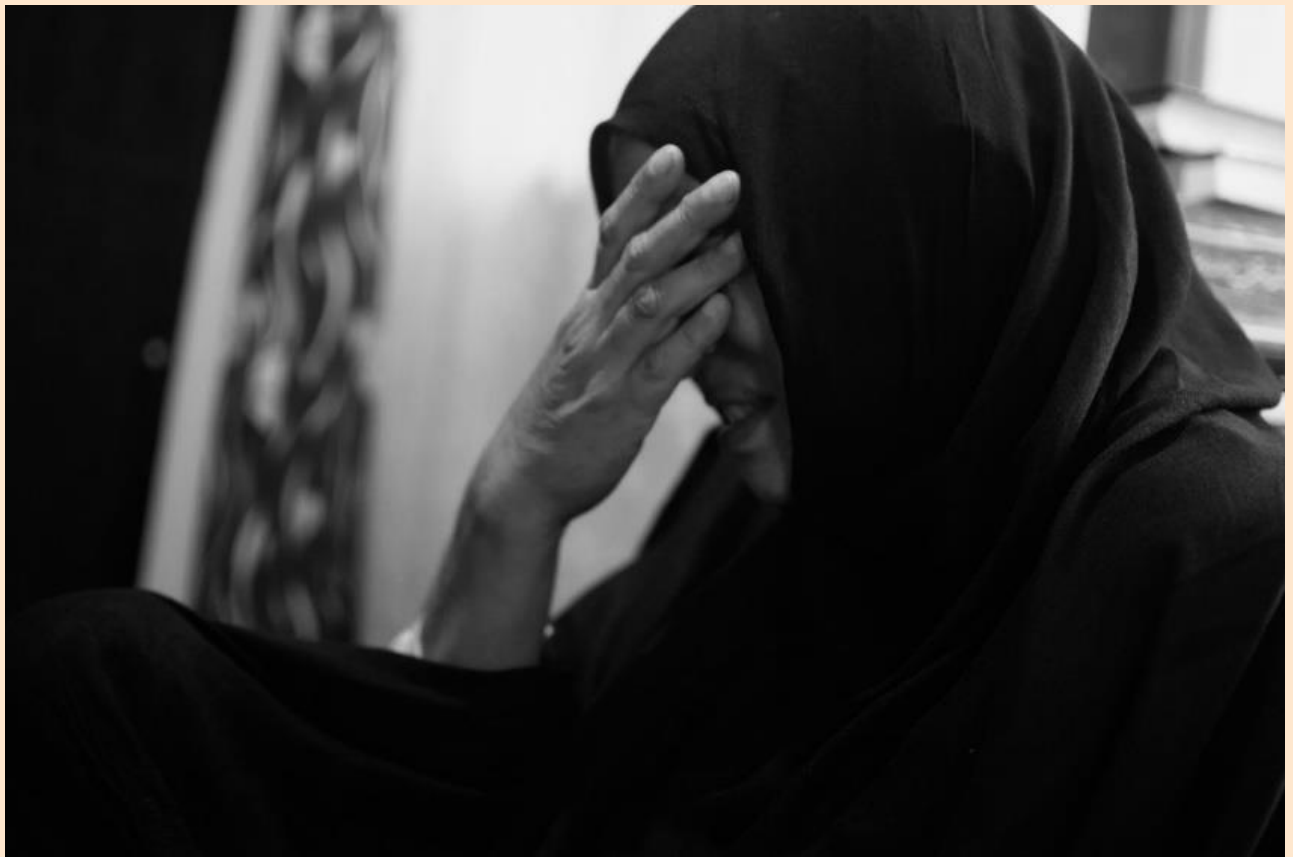
Figure 3. Woman breaking down into tears in a congregation. Photograph taken by the author, 2020.

long associated with Shia believers, including Shia women. Do these Shia practices have any bearing on the larger framework of public mourning in Kashmir? Does the political public mourning legitimize Shia faith practices for the majority population? Does women's participation in publicizing grief have subversive potential in a patriarchal setting? These are some of the questions I intend to explore in this section. I will take two sites for locating these questions: the women's gathering against enforced disappearances, and the Shia Muharram procession.