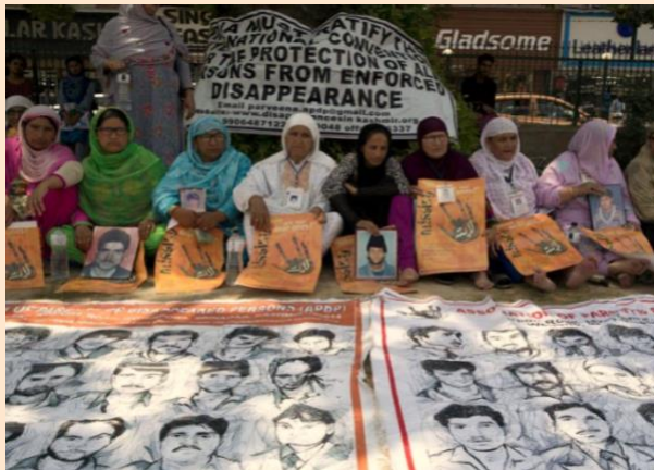
Figure 1. Family members of disappeared persons in protest in Kashmir.

This essay provides a comparative analysis of human rights violations in The Gambia and Kashmir with a focus on enforced disappearances. By analysing international conventions and redressal mechanisms on EDs, it examines the possibility of acquiring justice and accountability from hostile systems. The essay also brings forth the means of resistance undertaken by women in both Gambia and Kashmir against structural impunity in their pursuit of truth and justice.