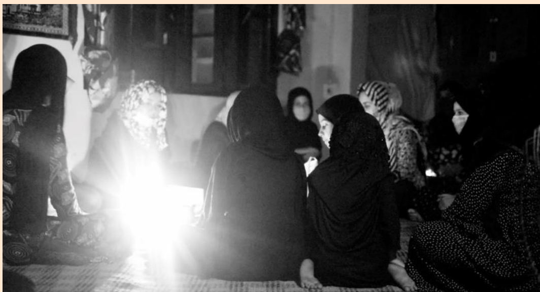
Figure 4. A group of young girls waiting for the majlis to begin.

In Muharram, Shia identity is also politicized vis-a-vis oppression of the Shia community around the world- from Kashmir to Palestine, Pakistan, Iraq, there is a collective sense of community enabled by the mobilization in Muharram. This consciousness is drawn from the major persecutions of Shias in Kashmir, a reclamation of the otherwise threatened minority. Shia processions are often met with violence around South Asia by hardliner majoritarian groups, and in Kashmir, by the state forces, almost replicating the message carried out in the processions of zulm (tyranny) against the besieged minority. For Shia devotees "the spiritual world becomes one with the physical through this focal parable" (Hegland, 1998, p. 251). Similarly, the APDP protests invoke this sense of global community with other contexts where enforced disappearances are a norm. In fact, the group is modeled over the Mothers of the Plaza de Mayo of Argentina and bears congruity with Saturday Mothers of Turkey; a similar collective of family members of the disappeared. Across the world, Shia Muslims and victims of enforced disappearances are united by the work of remembering. It also draws strength from abundance and numbers, the larger the participation, the bigger the impact, and the more difficult it is to forget, Karbala, and Kashmir.